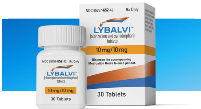
Other dosage strengths available